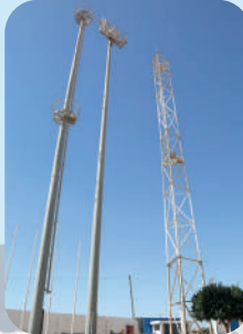
STADIUM/PORT HIGH MASTS