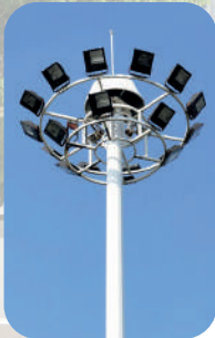
HIGH MASTS WITH MOBILE HEAD EQUIPMENT