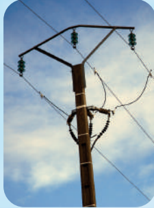
LOW, MEDIUM AND HIGH VOLTAGE STEEL POLE WITH CROSS ARMS