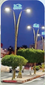
CONICAL POLES POWDER-COATED