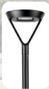
DECORATIVE LIGHTING POLE