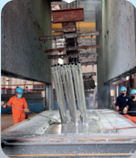
ALL STEPS OF HOT-DIP GALVANIZING