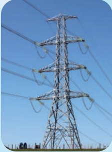
TRANSMISSION LINE TOWER