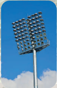
HIGH MASTS WITH FIXED HEAD EQUIPMENT