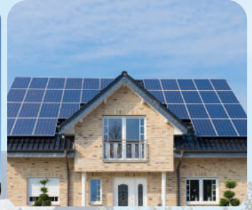
PREFABRICATED HOUSES WITH SOLAR ENERGY SYSTEM